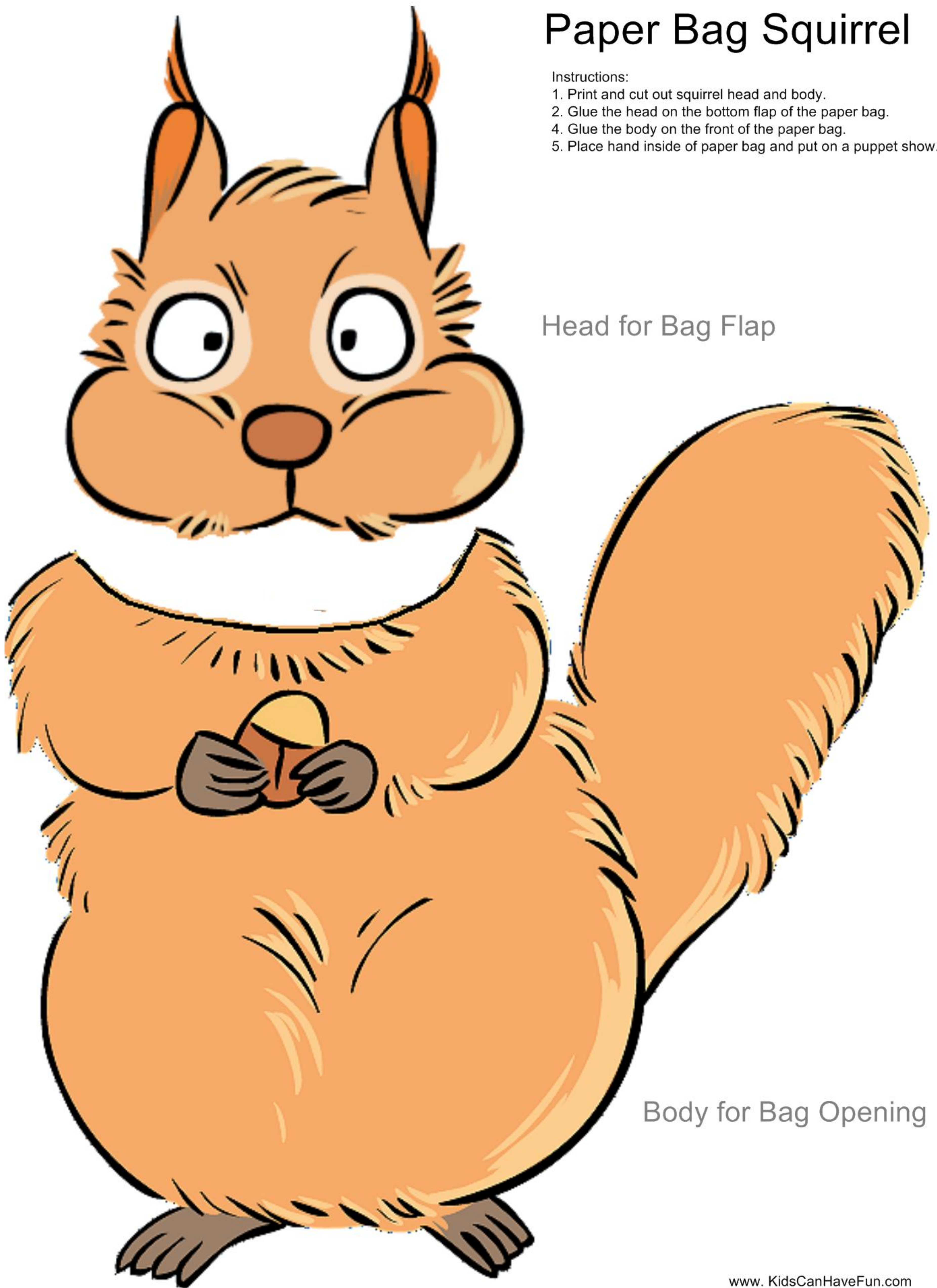
Head for Bag Flap